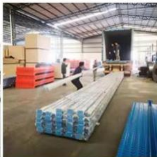
5. Loading for Upright Frame