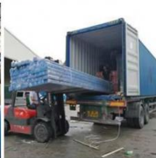
6. Loading for Wire Mesh Cage