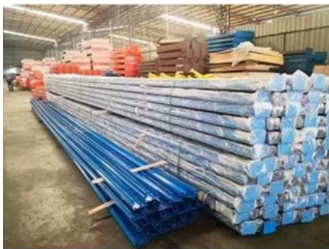
1. Package for Upright Frame