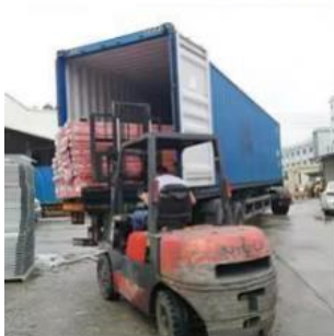
4. Loading for Beam