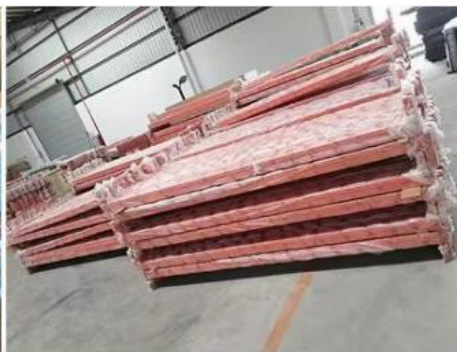
2. Package for Beam